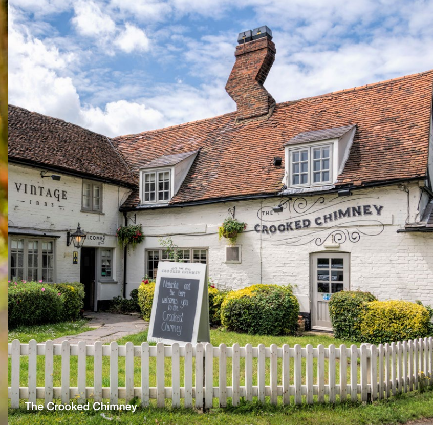
The Crooked Chimney