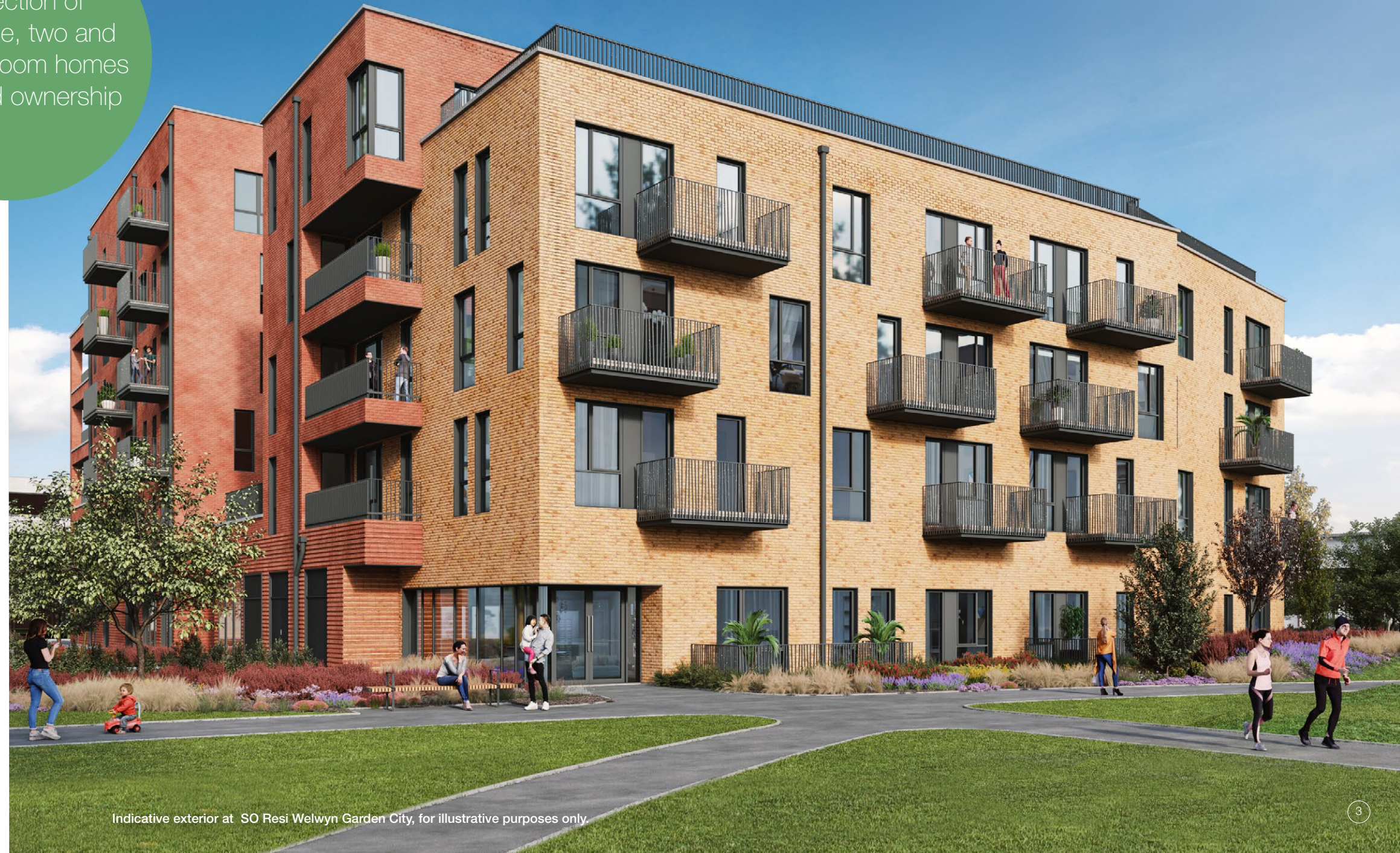
Indicative exterior at SO Resi Welwyn Garden City, for illustrative purposes only.