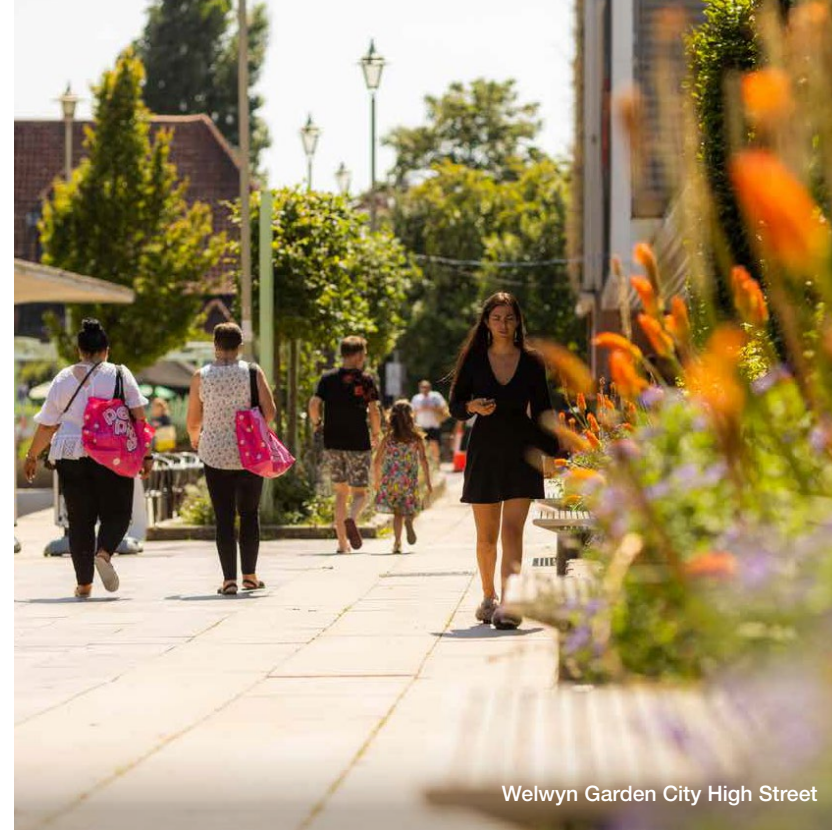
Welwyn Garden City High Street

Lush green space is all around, with the 126-acre Stanborough Park a local favourite for its large lakes, rope climbing courses, angling, sailing and children's playground. The edge of the Chiltern Hills at Falmstead is just a short drive away: the start of a wonderful walk passing through undulating land, ancient hedgerows and sunken lanes in the upper Ver Valley. Further afield, St Albans and Cambridge are both an easy drive away and perfect for days out.