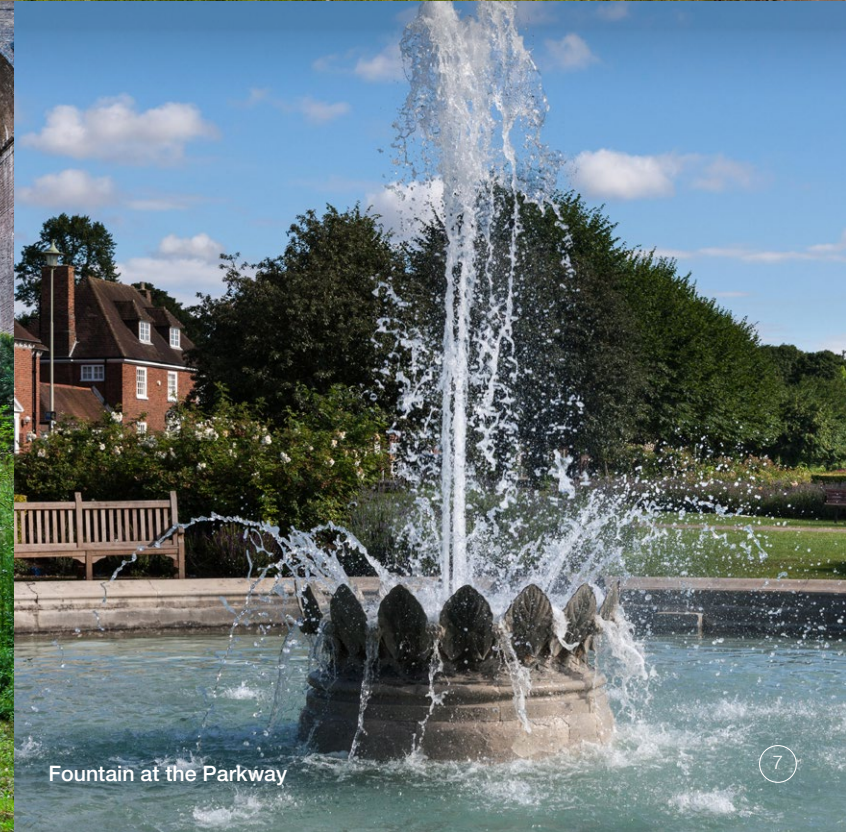
Fountain at the Parkway